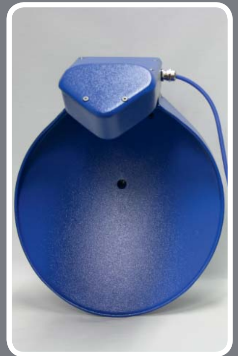
Intelligent Microwave Anti Collision System